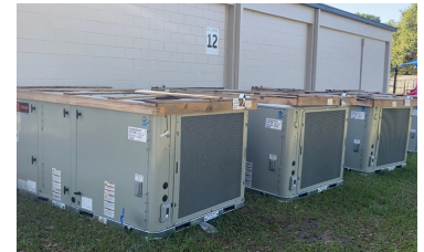
Robles Elementary School $3.6 Million - Partial A/C Overhaul, Security System, Flooring, Cooler/Freezer