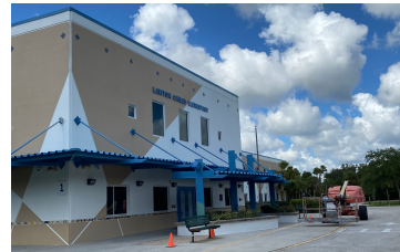
Chiles Elementary School $4.6 Million - A/C Overhaul, Flooring and Ceiling, Painting, Fire Alarm System