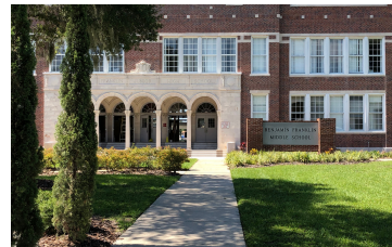
Franklin Boys Preparatory Academy $4.2 Million - A/C Overhaul, Painting, Floors & Public Address System